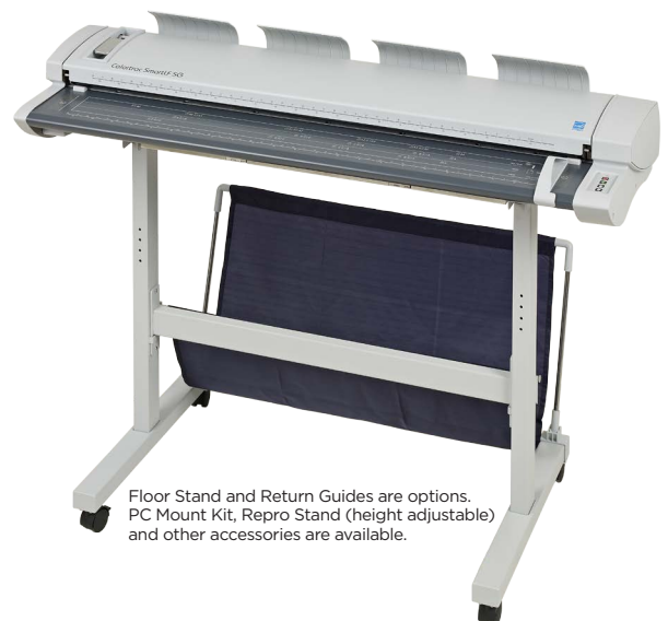
Floor Stand and Return Guides are options. PC Mount Kit, Repro Stand (height adjustable) and other accessories are available.